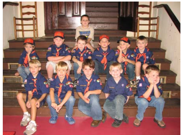
Boy Scouts visit