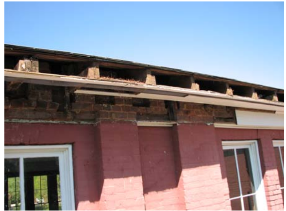
Replacing fascia boards