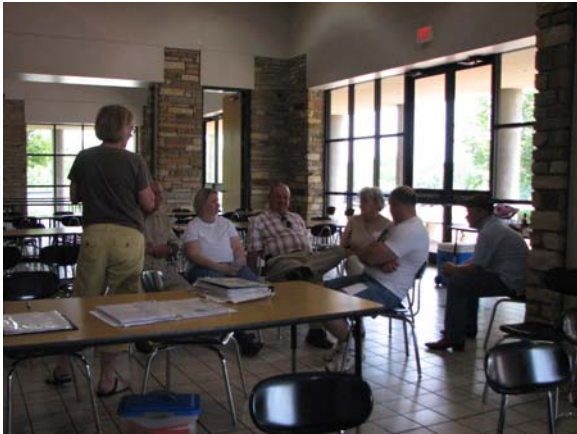
2 nd Annual Family Fair