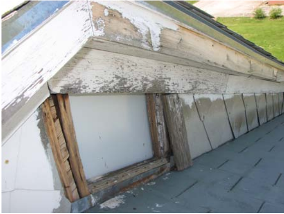
Whole in roof