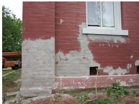
Front wall mortar (after)