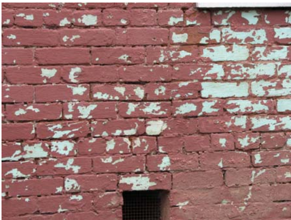
Front wall mortar (before)