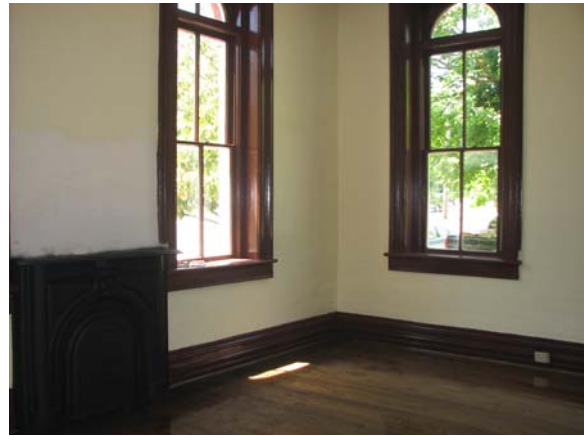
Office floor (after)