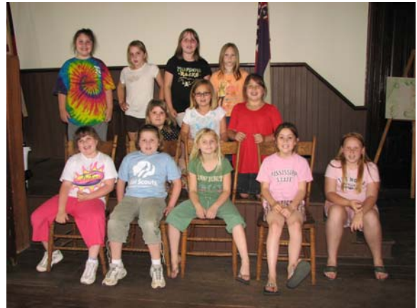
Brownie Troop works on badge