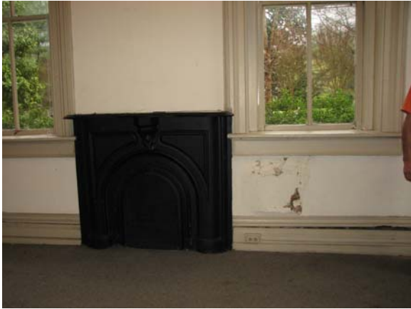
Office fireplace (before)