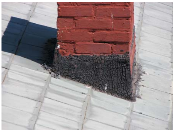
Chimney needs flashing