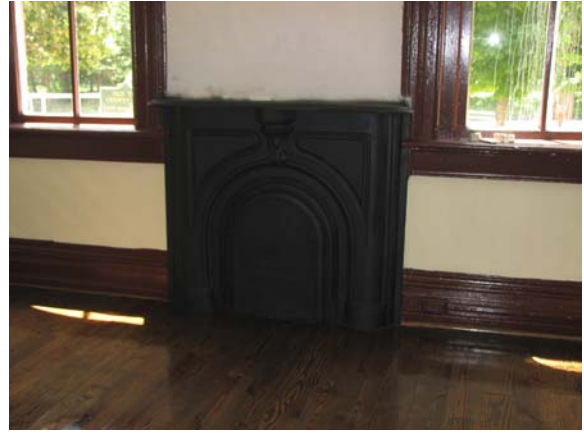
Office fireplace (after)