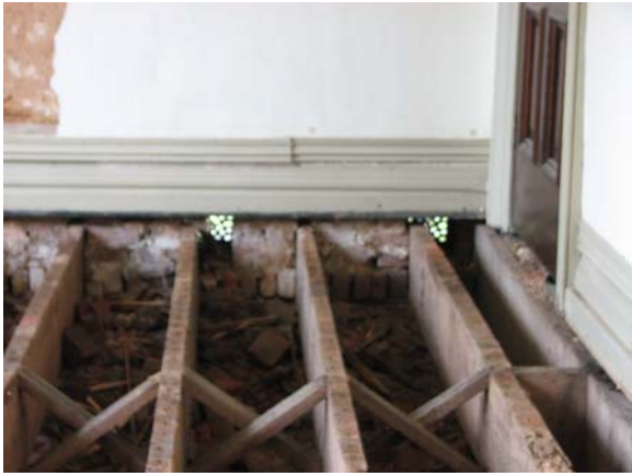
Office floor (before)