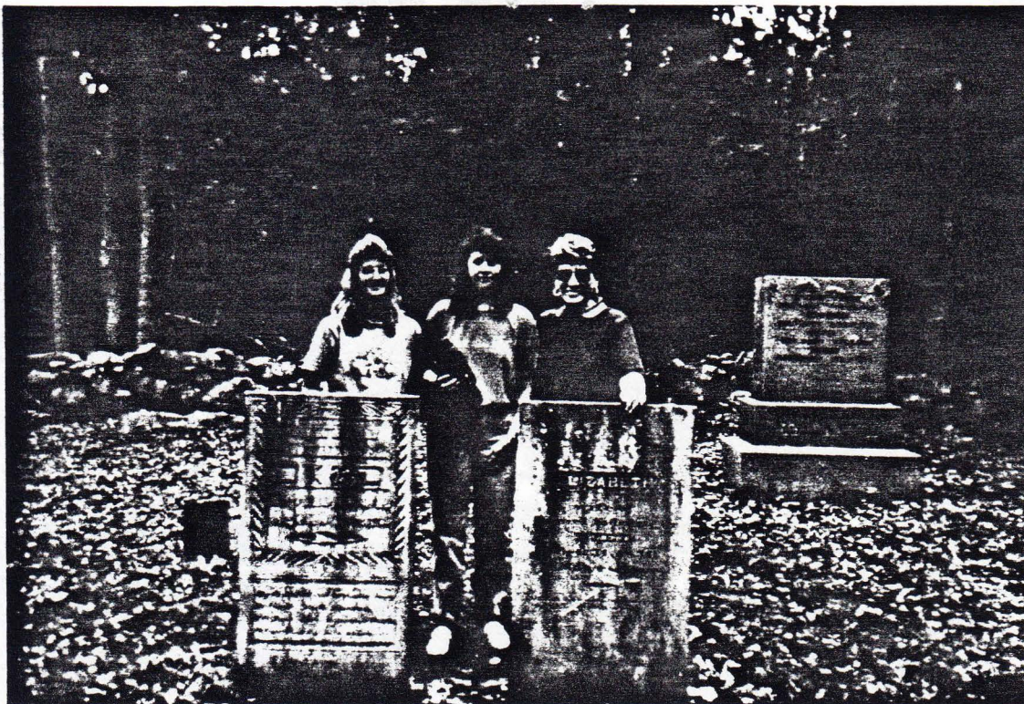
Views of OBBFHA members visiting Sidelinger Cemetery, Union, Maine July 1998