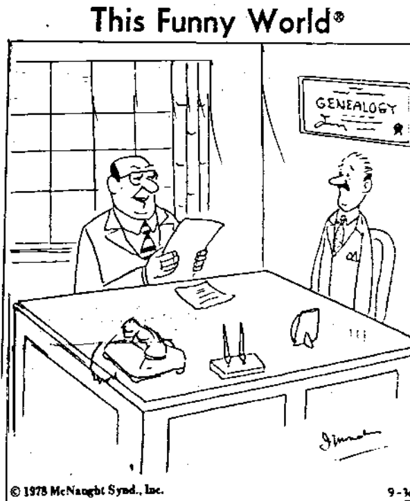
"The cost of tracing your ancestry comes to $500. Keeping the information quiet will cost you $1,000."