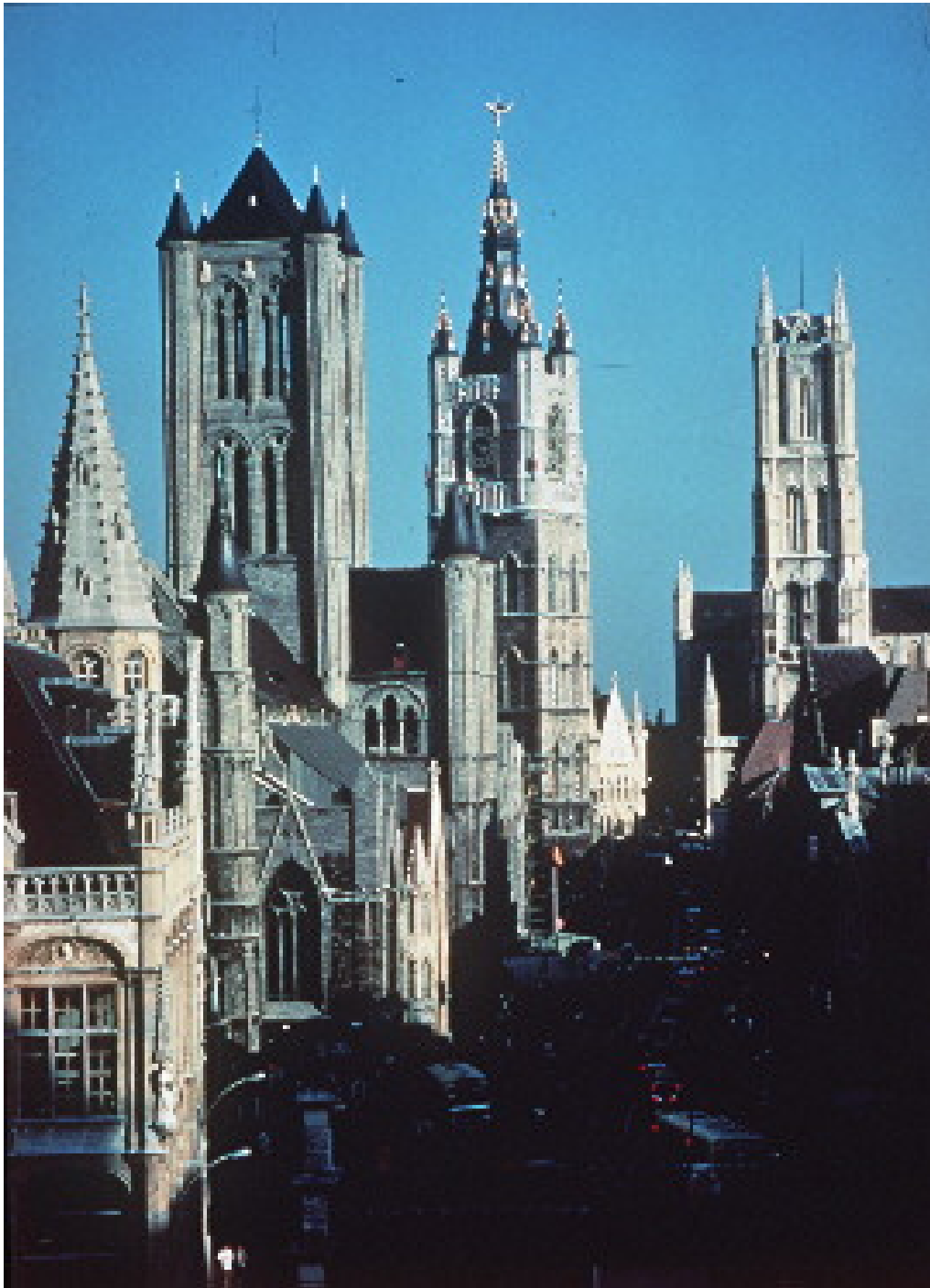
Three Towers of Ghent -

http://allserv.rug.ac.be/~sdconinc/Uniqwa/introduction/Gent.htm