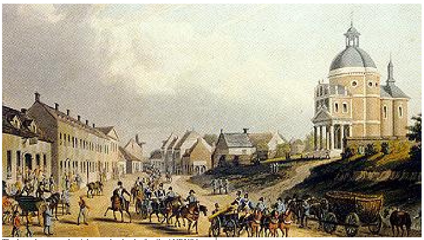
The large house on the right, used to be the family ANRYS house<sup>1</sup>. The double white house in the middle of the left block was the inn that served as WELLINGTON's General Headquarters.