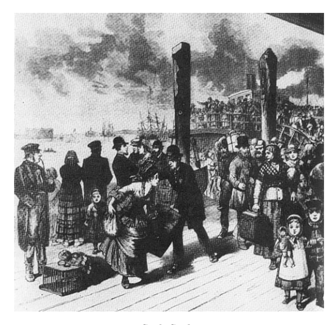
Castle Garden <a href="http://www.interet-general.info/rubrique.php3?id_rubrique=22">http://www.interet-general.info/rubrique.php3?id_rubrique=22</a>