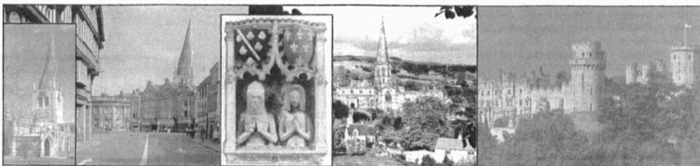
Chesterfield with its famous 'Twisted Steeple' church

This is truly the ultimate ancestral tour! A tour that will introduce you not only to your ancestor's delightful English countryside, cities, towns, villages and churches, but best of all it's people! For the true genealogist, the tour will be filled with family records, historical sites and information. For the rest it's a great way to see and experience the England so few people do!