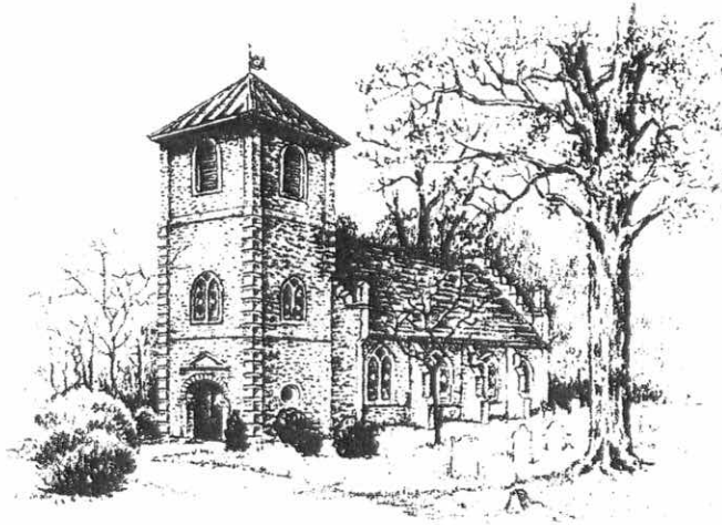
Historic St. Luke's Church ~ Built 1632 ~ Smithfield, Virginia.