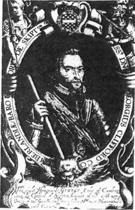
George, Earl of Cumberland

In July 1597, Earl George obtained verbal approval from the Queen for a mysterious expedition against the Spanish. As this expedition would unfold, it would prove to be one of the most strategic and intriguing efforts of the Elizabethan period. Most privateering ventures of the period had little planning and were hit-or-miss. Earl George's 1598 expedition was to have layers of planning, sophisticated disinformation releases, a sophisticated intelligence organization and spy network, a large amphibious task force of naval and land elements, and, most importantly, a strategic plan that transcended plunder and struck at the heart of the Spanish war machine.