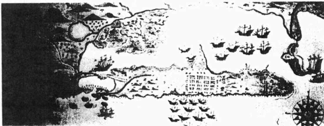
Cumberland's Attack on San Juan, 1598. The illustration includes: the landing; the causeway at El Puente; the Flemish ship grounded; the Spanish frigate; El Boqueron, 'The Red Fort', 'Mata Diablo'; El Morro; Cumberland's siege batteries; La Fortaleza; the friary; Rivers Toa, Bayamon, Piedras, Lutz; the 'Governor's island' and El Camuelo

What will be the outcome of the invasion of Puerto Rico by the Earl of Cumberland? How will this adventure affect Hercules' fortune and the rest of his life? See Episode 3 in the next issue of FFFF . (Save Episode 2, you need the map)