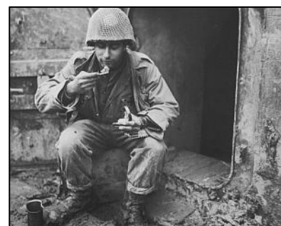
A GI of the United States 76th Infantry Division dines on K-rations outside a German pillbox.

Many changes were effected in the components and packaging of the K-ration during the seven revisions of the ration before the final World War II specification was published. During that period the variety of biscuits was increased, newer and more acceptable meat products were introduced, malted milk tablets and D bars gave way to a variety of confections, additional beverage components were provided in improved packages, and cigarettes, matches, salt tablets, toilet paper and spoons were ultimately included as accessory items.