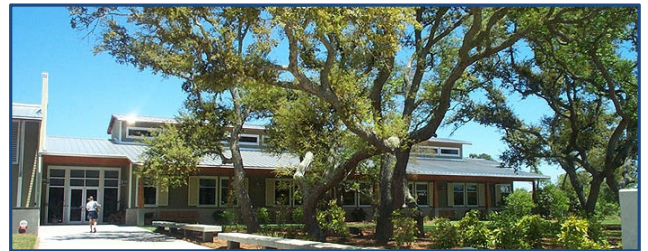
150 Sibert Avenue, Destin, FL, Phone: 850 837-8572