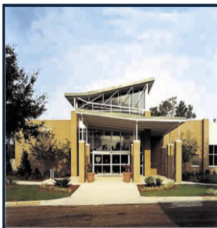
206 North Partin Drive, Niceville, FL Phone: 729-4090.

The Niceville Public Library provides ready reference help by phone or in person; Book, magazine, and newspaper collections; Quiet study rooms; Internet information; Large print book collection; Consumer,