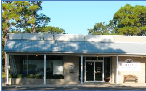
115 Westview Avenue, Valparaiso, FL Phone: 850 678-2615

The Heritage Museum of Northwest Florida maintains archives with materials pertaining to local, regional and state history. Research materials include books, photographs, newspapers, manuscript documents, obituaries, oral histories, periodicals and maps.