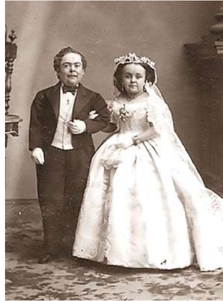
General Tom Thumb and Wife in 1863

February 13 President Lincoln is visited by diminutive circus act General Tom Thumb and his wife.