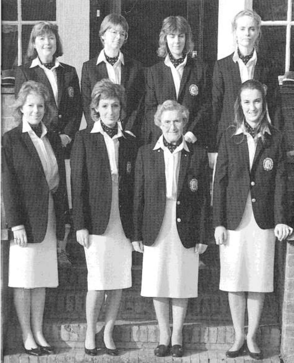
Figure 21. The GB Ladies Rifle Team 1988

Despite a post war surge in women's shooting (and its already impressive history), there was no official Great British Ladies Team until 1988 – pictured below.