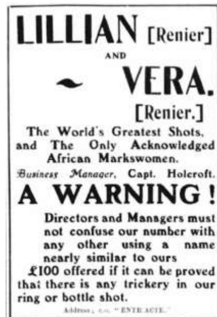
Figure 5. Entre'act advert 1906

Always a show-business shooter, Lillian went on to join Frank E. Fillis's Great Savage South Africa Show 8 , which a year later was exhibiting in Glasgow.