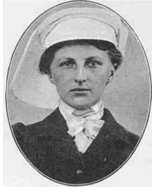
Figure 6. Miss Lewes

Florence joined the South London Rifle Club (its only female member) and learned to shoot. In July 1904 she arrived at Bisley to compete. She scored 26 out of 35 at 600 yards.