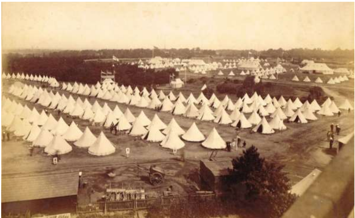
Figure 1. Wimbledon 1889 – the final camp held there

Within twenty years it was apparent that the NRA would have to find a new home for its annual camp. A growing population and the subsequent continual suburban development coupled with the increased effective range of rifles was raising safety concerns.