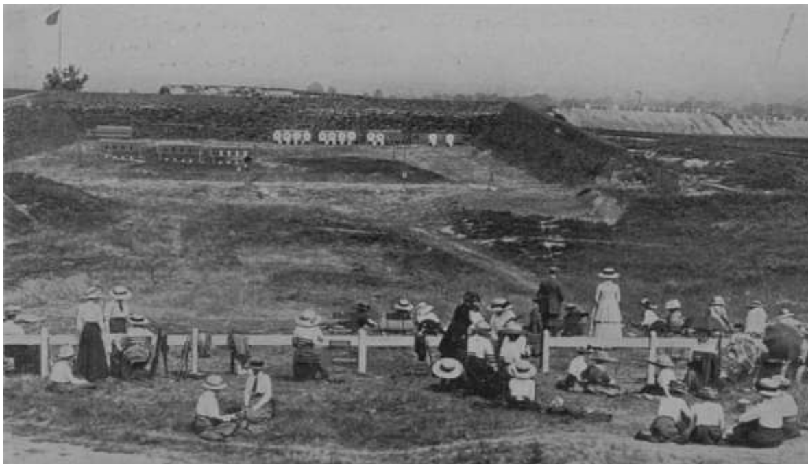
Figure 13. Surrey Ladies' Rifle Association 1911