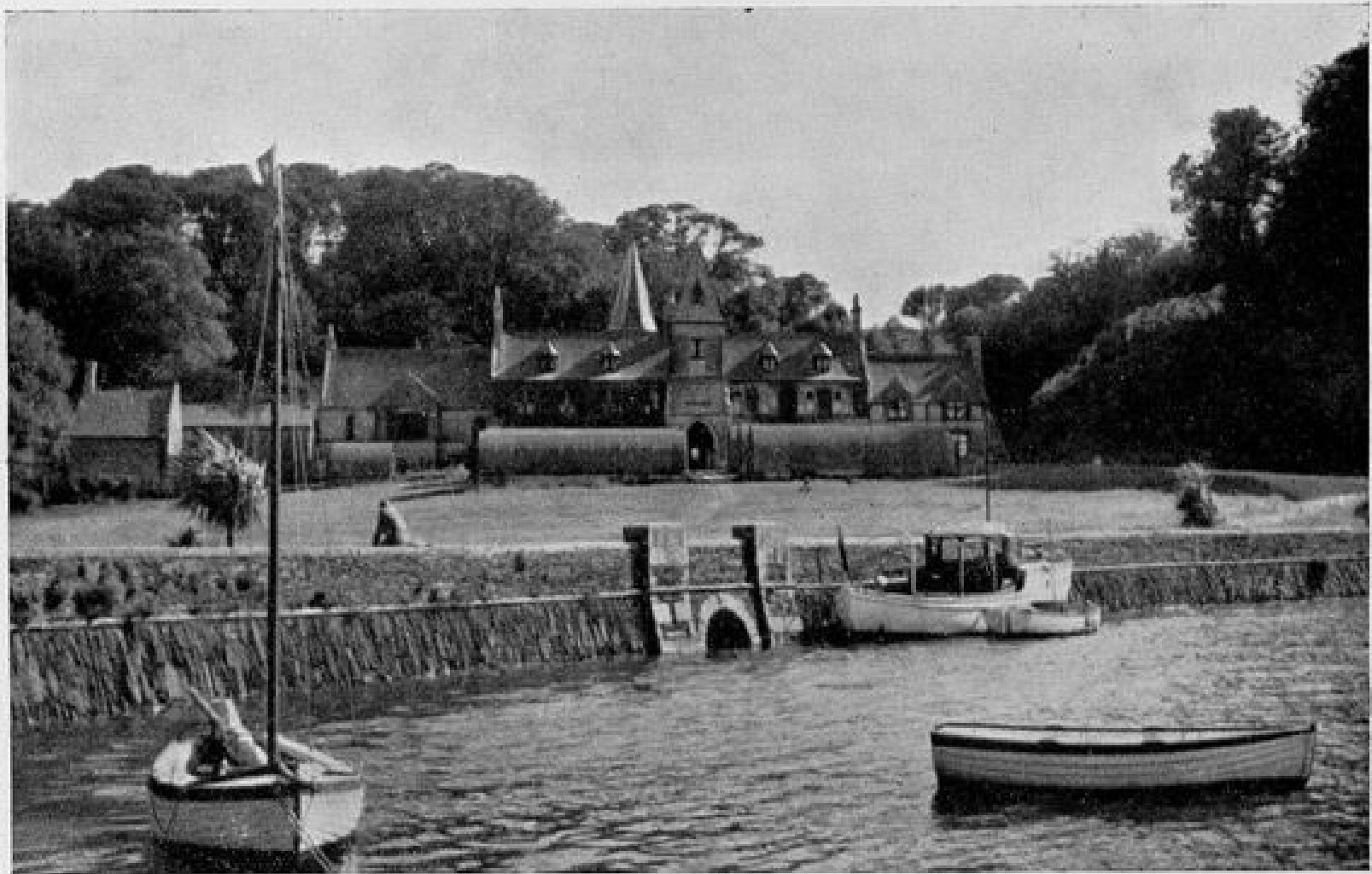
“ Place ” Manor.