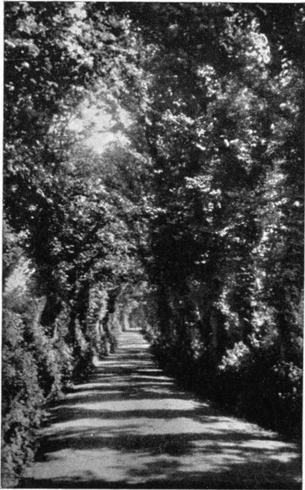
The avenue of trees on the way to Place Manor.