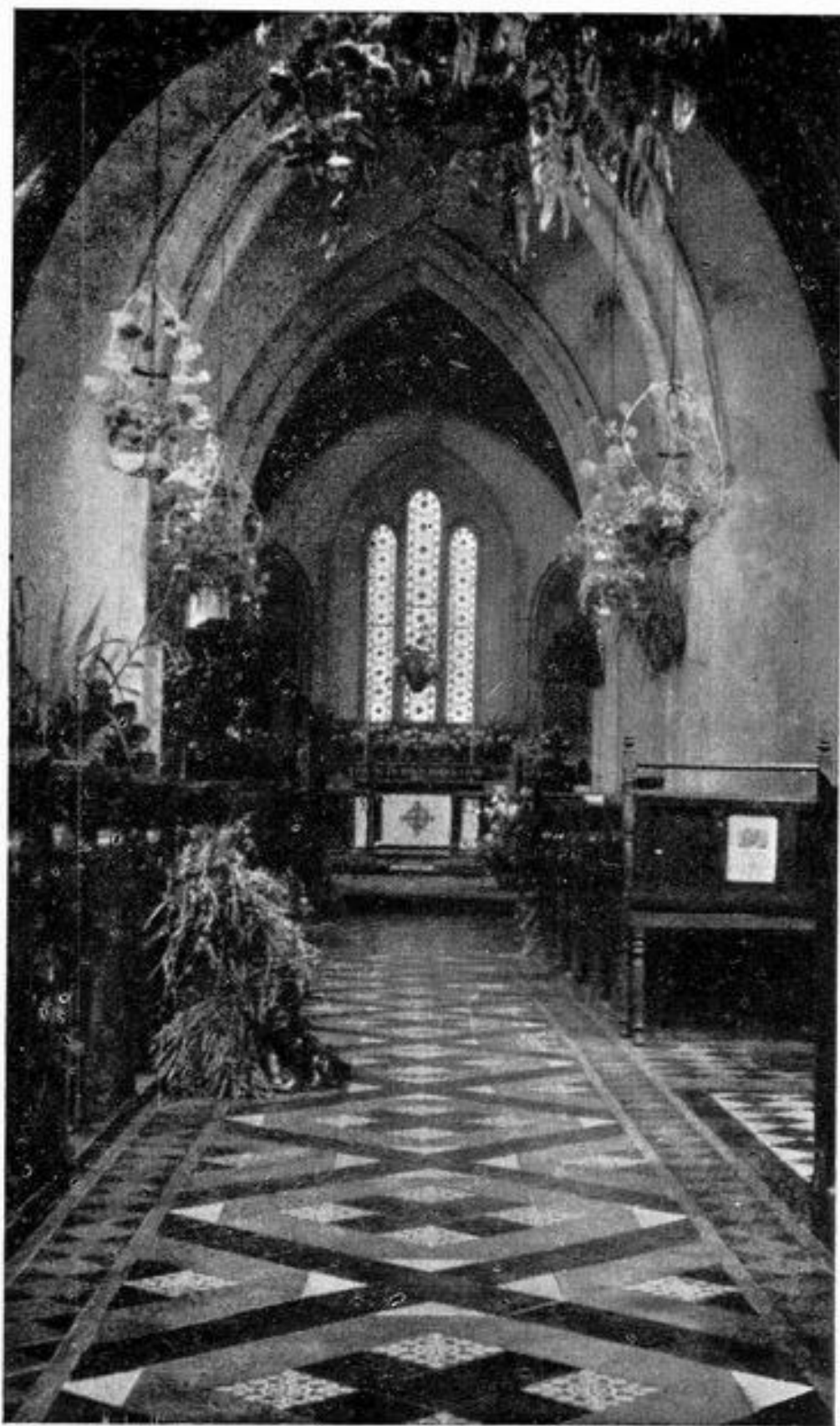
Our own Church, "Place".