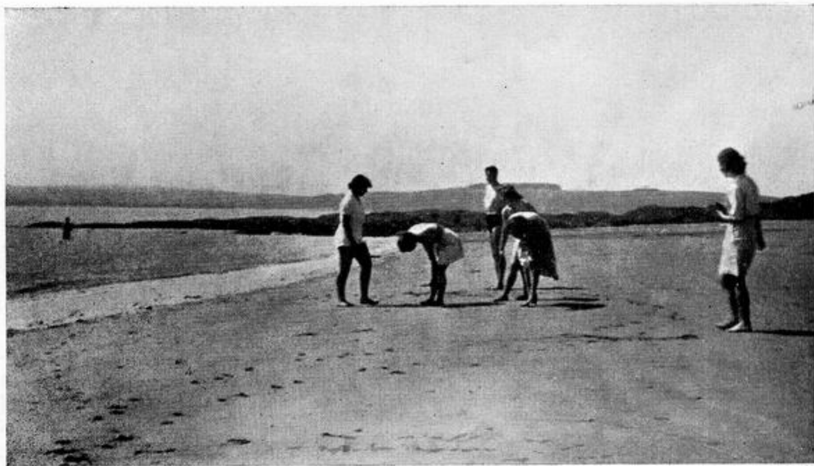
Little Molunan Beach, "Place".