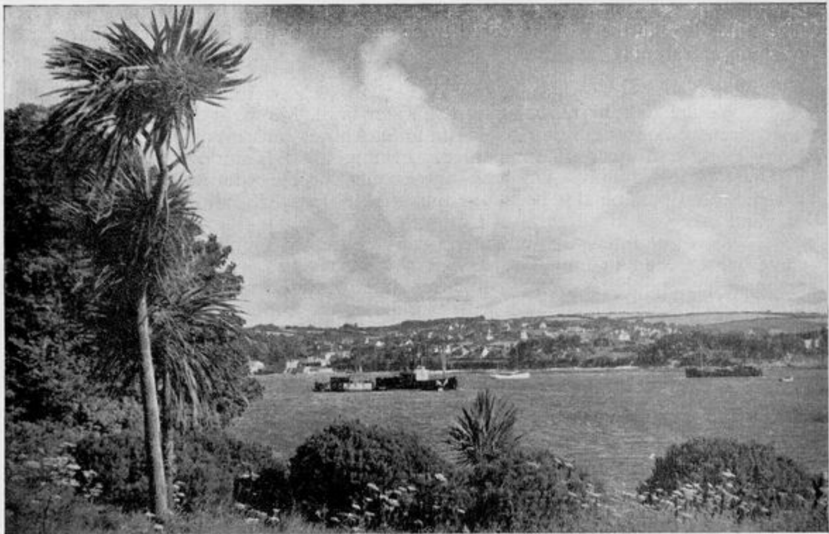
The view from the end of the garden.