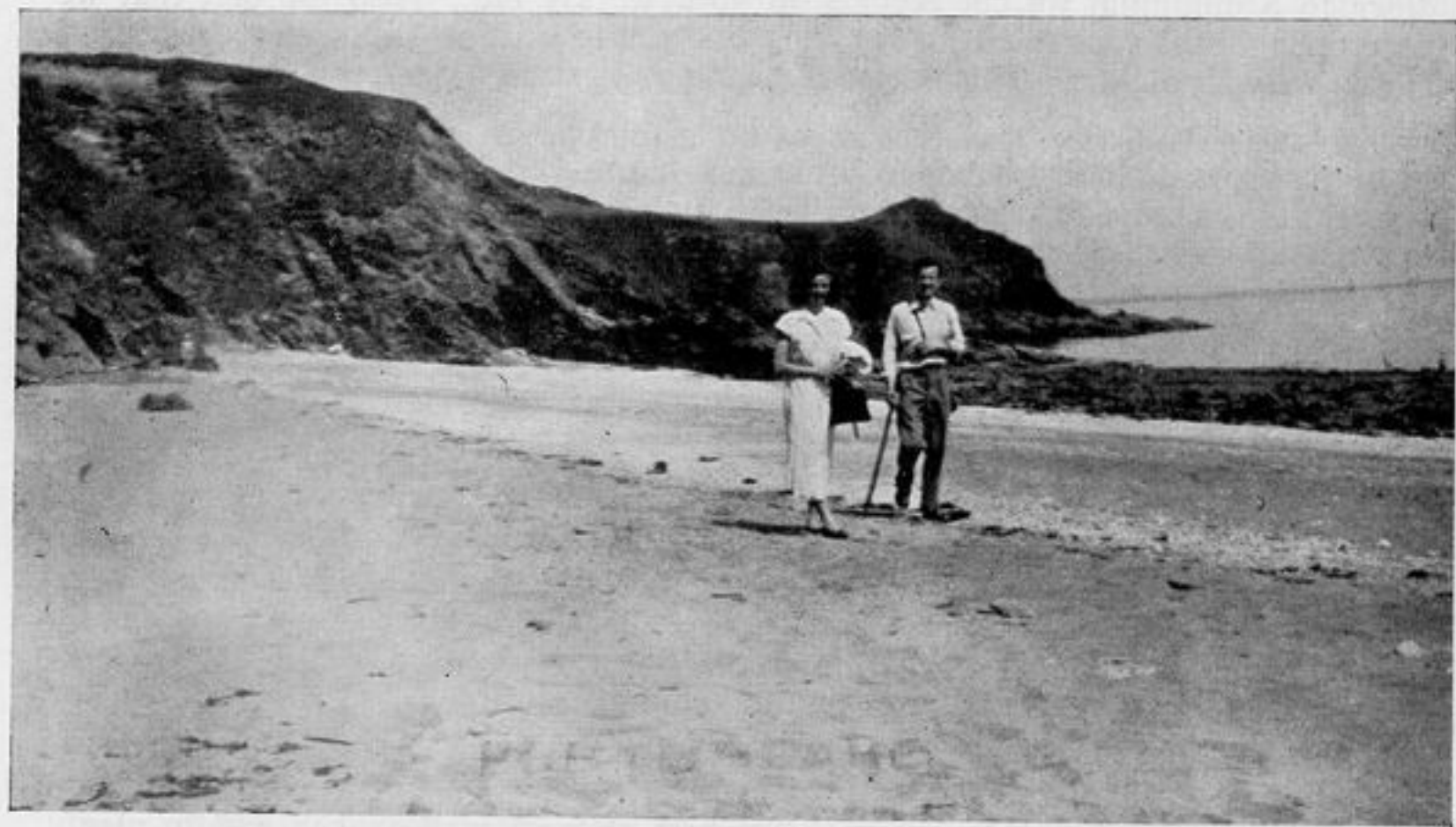
Porthbeor Beach, "Place".