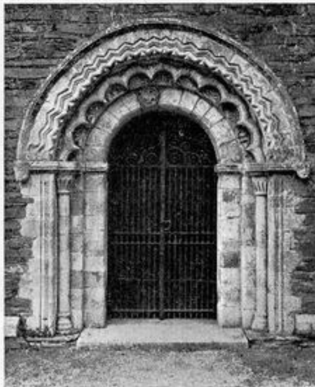
The ancient Norman Door-way of our own Church.

THERE'S NO "PLACE" LIKE HOME THERE'S NO HOME LIKE "PLACE"