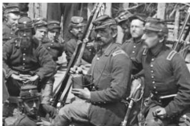
Manassas, Va. Men of Co. C, 41st New York Infantry. [photo not of author's ancestors]