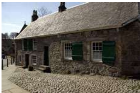
Original weaver's cottage in Kilbarchan

was listed as a "calico printer." Some of the other Grangers were pirm (spool) winders. When my