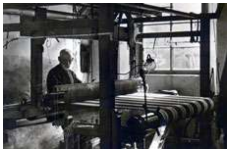
Hand loom weaver in Kilbarchan

It seems that almost everyone in the village of Kilbarchan, including all the Grangers, worked producing fabrics of wool, silk, and cotton. Product could then easily be shipped out of nearby Glasgow. Rebekah is listed as "hand loom weaver" in the 1841 census and William