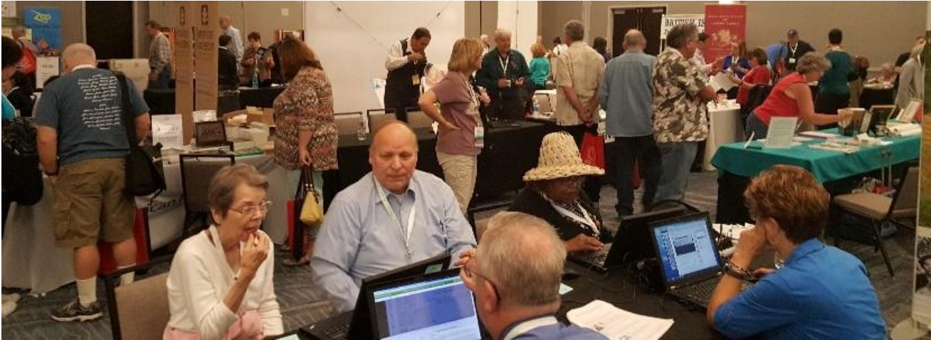
Vendor booths at the 2015 Southern California Genealogical Society Jamboree

If you haven't experienced the excitement and educational opportunities afforded by attending a major genealogical convention, you don't know what you are missing! In early June, I was able to attend the 46th Annual Genealogical Jamboree, held in Burbank California by the Southern California Genealogical Society ( http://genealogyjamboree.com/ ). It was amazing! I attended as a vendor and spent all three days on the floor talking to genealogists, vendors, volunteers, bloggers, and presenters.